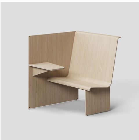
CUBICLE Work Station

Built-in response to +Halle's lively and collaborative Annual Briefing discussions on Producing, Cubicle comprises a conceptually fresh take on a traditional cubicle — including a meter-twenty wall, a one-and-a-half seater bench and a comfortable table. The innovative 'quarter' structure is indicative of how far public seating has come, catering as it now does to our need for spaces that encourage focus as much as interaction.