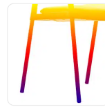
Other Advanta Standard Powdercoat Colour (special order)