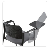
Arms + Writing Tablet (Folding & Stackable) Right Side