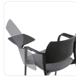
Arms + Writing Tablet (Folding & Stackable) Left Side