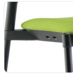
No Linking Device