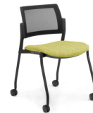
Altus Side Chair - Upholstered Seat & Mesh Back