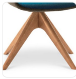
L17 Timber Swivel Base - Oak Stain