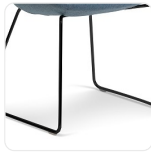
S5 Sled Base (Black Powdercoat)