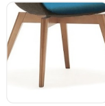
L7 Timber Base - Oak Stain