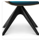
L17 Timber Swivel Base - Custom Black Stain