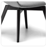
L7 Timber Base - Black Stain