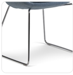
S5 Sled Base (Chrome)