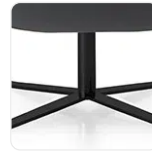
R13 Black Powdercoat 4 Way Swivel Base