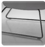
S7 Sled Base - Black Powdercoat