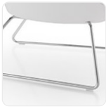
S7 Sled Base - Chrome