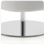
D9 Disc Swivel Base (Special Order option, extended lead time)