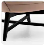
L30 Timber Cross Base - Custom Black Stain