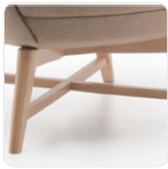
L30 Timber Cross Base - Oak Stain