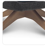
L21 Timber Swivel Base - Oak Stain