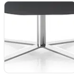
R13 Polished 4 Way Swivel Base