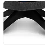
L21 Timber Swivel Base - Custom Black Stain