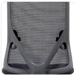
Adjustable Lumbar Support