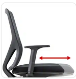
Adjustable Seat Depth