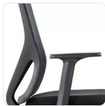
1D PU Adjustable Arms