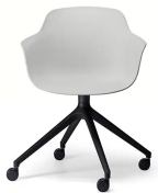
Loria Armchair PP