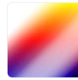
Other Advanta Standard Powdercoat Colour