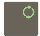
Sand (ECO) 100% Recycled