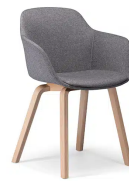
Loria Armchair Upholstered