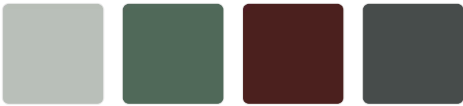
Light Grey Dark Green Dark Red Charcoal