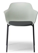
Loria Armchair with Seat Pad