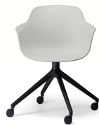
Loria Armchair PP