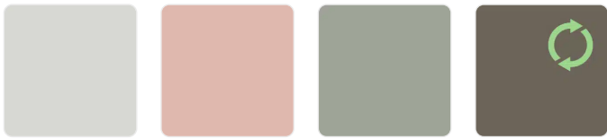
Oyster White Pink Mint Sand (ECO) 100% Recycled