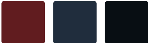
Red Navy Black