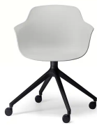
Loria Armchair PP