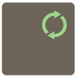
Sand (Eco) 100% Recycled