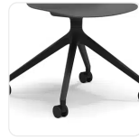
4 Way Swivel Base - Fixed Height