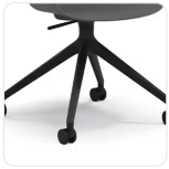
4 Way Swivel Base - Adj Height