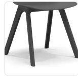
4 Leg Plastic Base