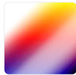
Other Advanta Standard Powdercoat Colour