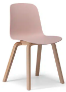
Loria No Arms PP