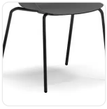
4 Leg Metal Base