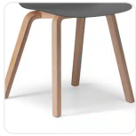
4 Leg Timber Base