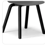
4 Leg Timber Base - Custom Black Stain