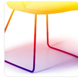
Sled Base (Other Advanta Standard Powdercoat Colour)