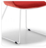
White Sled Base