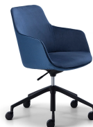
Saba - Meeting