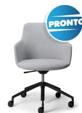
Saba - Meeting 'Pronto'