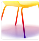
4 Leg Base (Other Advanta Standard Powdercoat Colour)