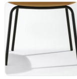
Black 4 Leg Base