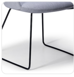
Black Sled Base