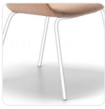
White 4 Leg Base