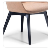
L7 Timber Base - Black Stain