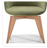
L7 Timber Base - Oak Stain