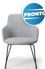
Saba Armchair 'Pronto'